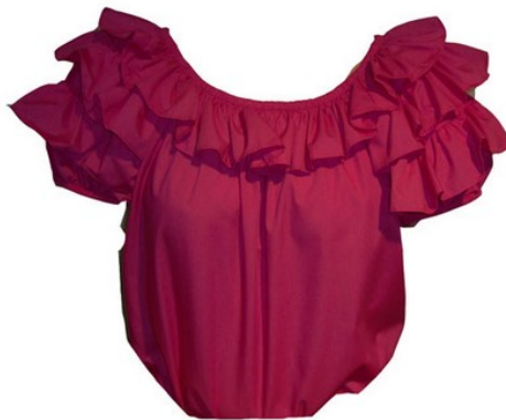
Style # 514