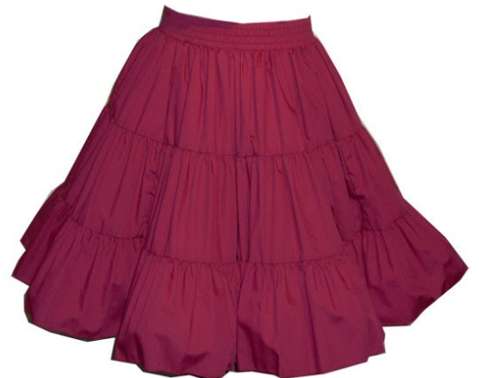
Style # 2060