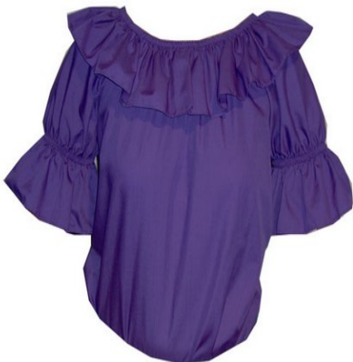
STYLE # 980

Please complete your order form and place your order with Marisca @ Square Up Fashions NO LATER THAN March 1, 2015 . Any questions, please call Carol Woodcock @ 714-334-2141